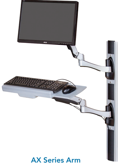
With Keyboard Extender